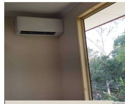
New Office A/C

It is difficult times but we are the lucky country and state. Hopefully, in the not too distant future, we can get back to normal whatever that is, and maybe not till mid next year. Wishing all the best in health and do not hesitate to contact any committee members if we can help in any way.